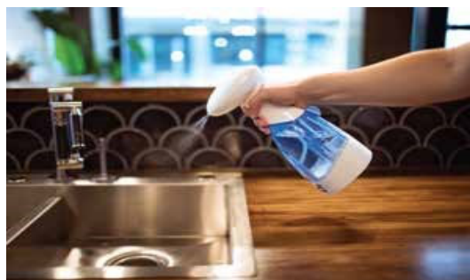
Figure 1. Enozo Technologies, Inc. SB100 Aqueous Ozone Spray Bottle

effects of closer exposure of edge and corner wells to atmospheric conditions.